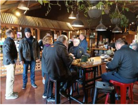
Coffee time inside Yahava.