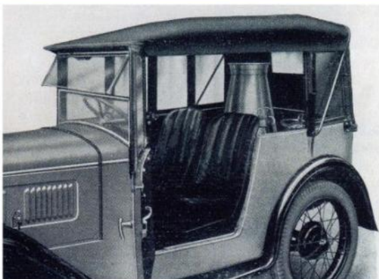
One churn removed and seat for passenger provided.

The distance which a good horse will cover in a regular day's work is well short of 30 miles. The van will cover 5 times that distance if required; but as a milk round extends usually only 6 or 7 miles, it is clear that the time saved may be used for extending the radius of calls, and the business increased, without extra cost for labour or increase in the hours of actual delivery.