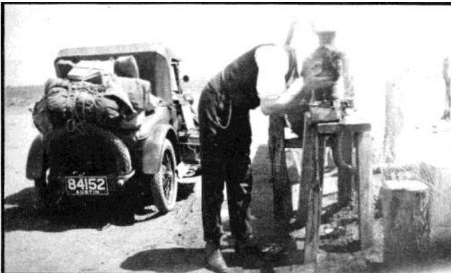
Welcome wash on the Nullarbor Plain.

7th Day. Monday. We rose very early this morning to get a good early kick off for run, be blowed if our back tyre was not flat again, so while dad got breakfast I mended it and while he was packing up I greased and attended the car. This trouble hindered us a bit but we left at 7 o'clock, just as we were about to leave of course we thanked the old chap for the lend of his shed and so forth. He came out of his house in a rage and said, "You B ..... overlanders, you are all the B ..... same. Leave papers all over the B. .... place". So we had to pick up the papers, about 2 or 3 small pieces and I got a stone and blocked the wheel so that the car wouldn't run back and he said "You take stones and put them all over the place you B ..... overlanders, you're all the B ..... same". This was not a very nice send off. We had about two miles to go and we left the old sea bed and had to climb the cliffs again after travelling on the old sea bed for 120 miles from Eucla to Chadwa.