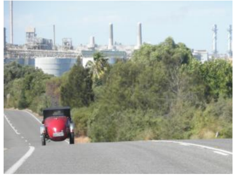
Club Run—To Smirk Cottage, Medina March 2014