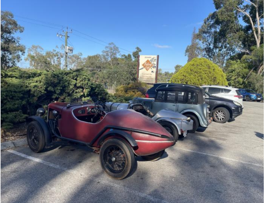
Breakfast at Gidgegannup en route to Toodyay.

Baby Torque is published by The Austin Seven Club of Western Australia (Inc) 34 Honey Road, Forrestfield, WA, 6058