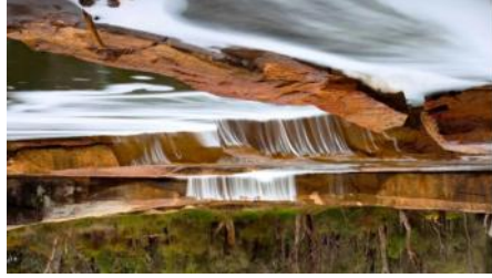
Lovely brekkie and amazing scenery at Gidgegannup