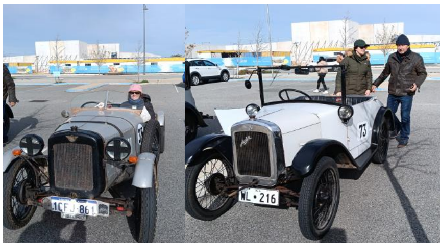
Perkolilli participants ▲