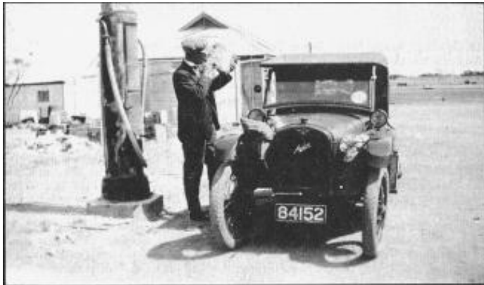
Wirrulla, SA. Petrol at 3/6 a gallon

We went on, talk about road, we had to go down creeks, dry of course, but the banks were steep. The road was for a wide track car and we had to make our own tracks. This made it a bit hard, especially in the sand. You ought to see the kangaroos and emus, lots of them. We knew there must be a station here now because we knew these animals would have to have water, so sure enough we sighted a station. This was Yardea. The car was running wonderful up to this. Yardea is about 170 miles from Port Augusta sheep station, left because of drought. We pulled up at one of the houses and asked whether they would mind if we put up for the night in one of their sheds. This was about 7 o'clock. They said there is a spare room over in the barn so we were fortunate. We had tea but couldn't have a wash because they're carting water 8 miles now, the water hole is running dry and when it does they will all have to clear out, half have gone now about 12 whites and a few blacks. We were soon in bed and asleep. You only have to get up early or go out at night and you'll see kangaroos and emus, horses and other animals all around the station after water, poor things. Just as well we brought our own water from Port Augusta. Just give you an idea how dry things must be here.