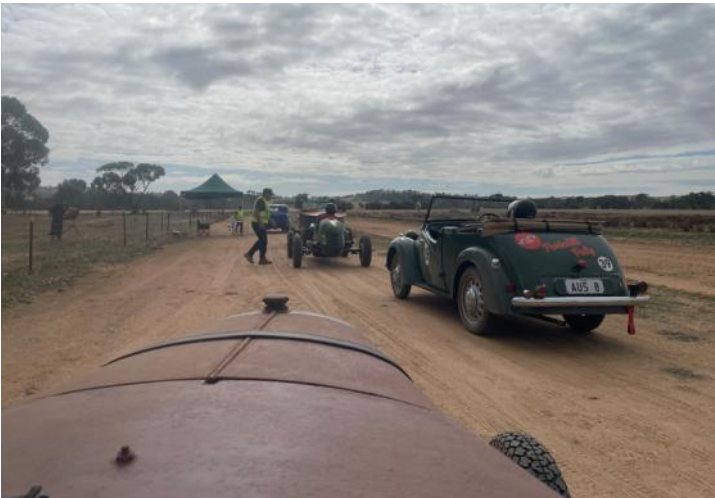
Driver view waiting in the dummy grid at Beverley Horse Racing Track, Sunday 19 April 2026