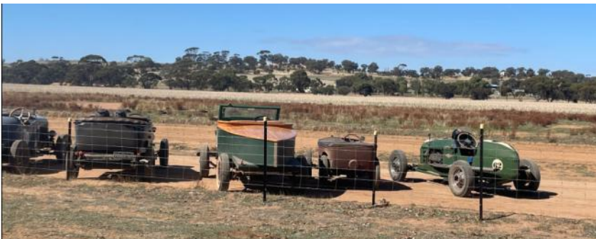
Chummy with bigger friends at Beverley Horse Racing Track