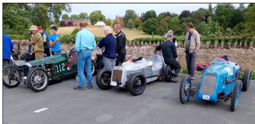
Paddock at Loton Park