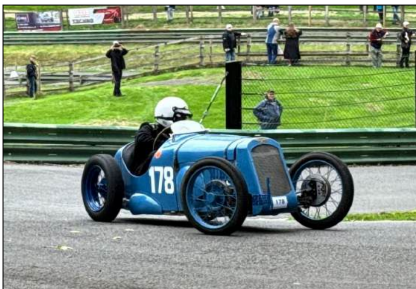
Pardon hairpin at Prescott