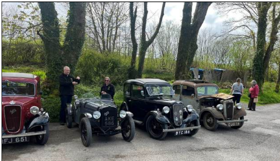
A good variety of cars for the recent Woody Bay Run