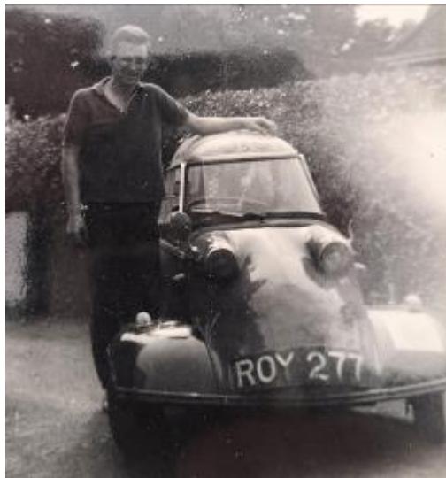
Me and my Messerschmitt

My first vehicle was a Messerschmitt 3 wheeler that I had at sixteen. You could drive it on a provisional licence and this gave me a great deal of freedom and I joined the local scooter and three wheeler club and went on many rallies (breaking down frequently, but learning all the time).