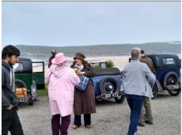
A bit blowy!