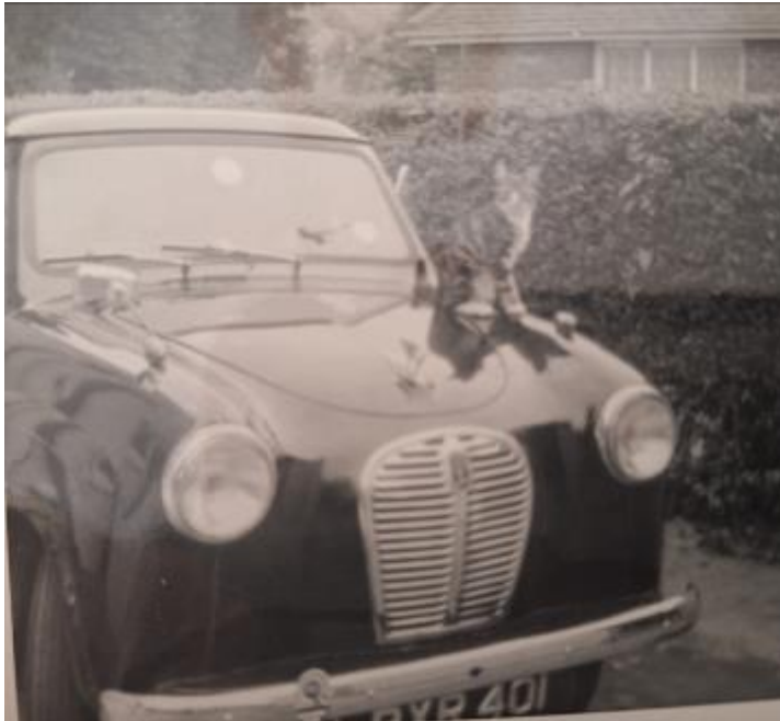
My Austin A30 with Mr Jinks the cat.